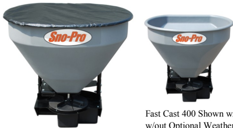
Fast Cast 400 Shown w/and w/out Optional Weather Cover