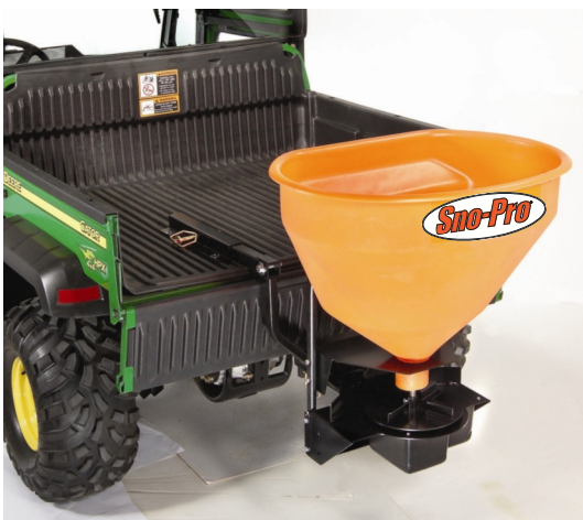
Fast Cast 300 Shown with Optional In-Bed Mount