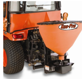
Fast Cast 300 w/Optional Weather Cover & 3-Point Mount