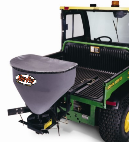
Fast Cast 400 w/Optional Weather Cover & In-Bed Mount