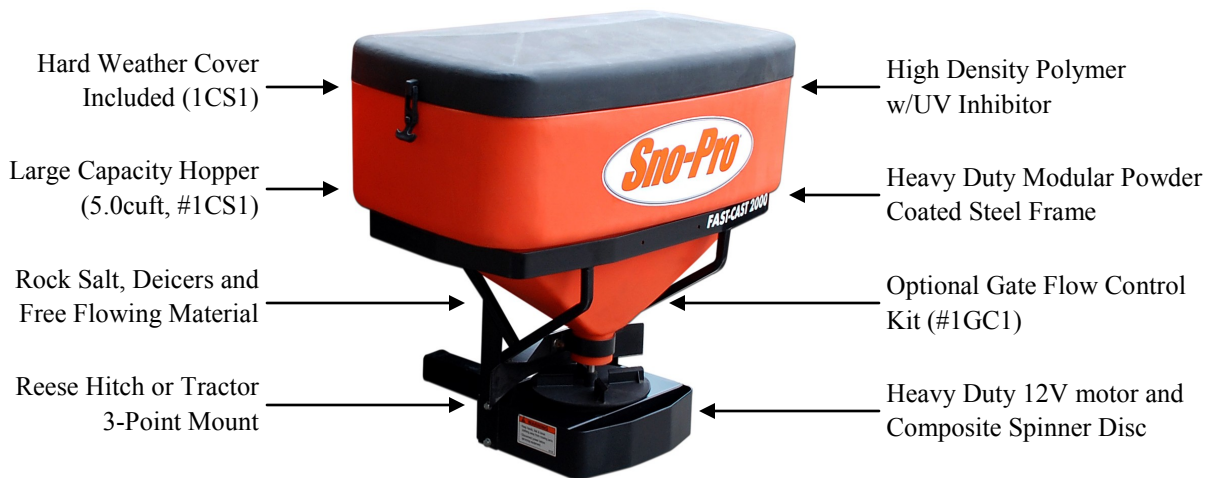
Fast Cast 2000 Spreader Shown