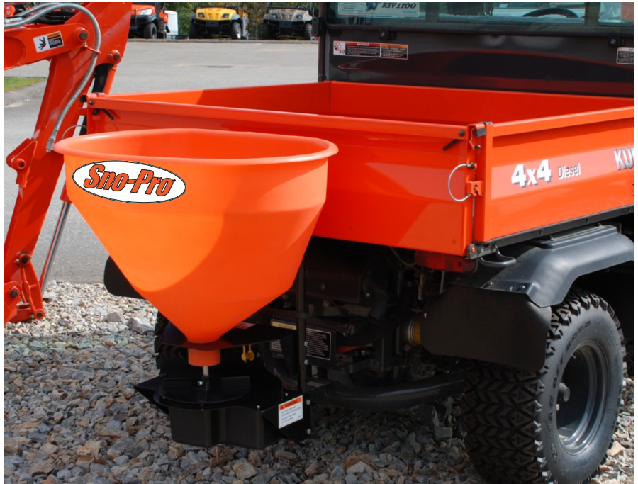
Fast Cast 300 Shown with Reese Hitch Mount

Introducing our full line of Sno-Pro™ Tailgate Spreaders. These all season spreaders feature durable hoppers, proven drive trains and quality from a name you can trust. Sno-Pro™ Tailgate Spreaders spread a wide variety of free-flowing material. Sno-Pro™ Tailgate Spreaders are built to last and will work hard in all conditions.